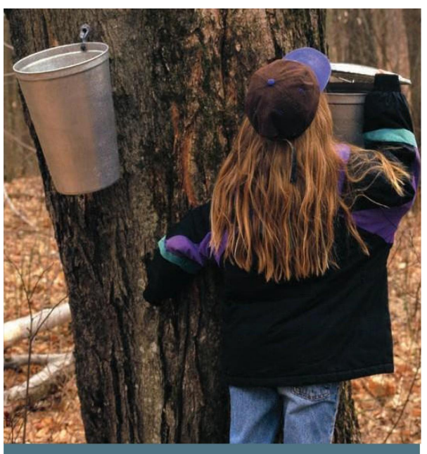
Learn to change your future using what you already have