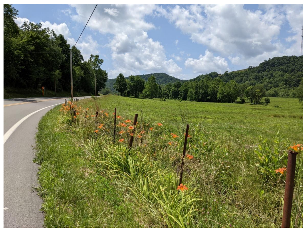
Route 5 Just outside of Glenville. "Oh the hills, the beautiful hills, how I love the West Virginia Hills!"

It was a fun weekend and I think a successful one for West Virginia Maple!