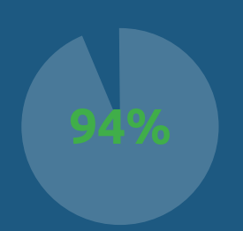
Percent Receiving Scholarship Assistance