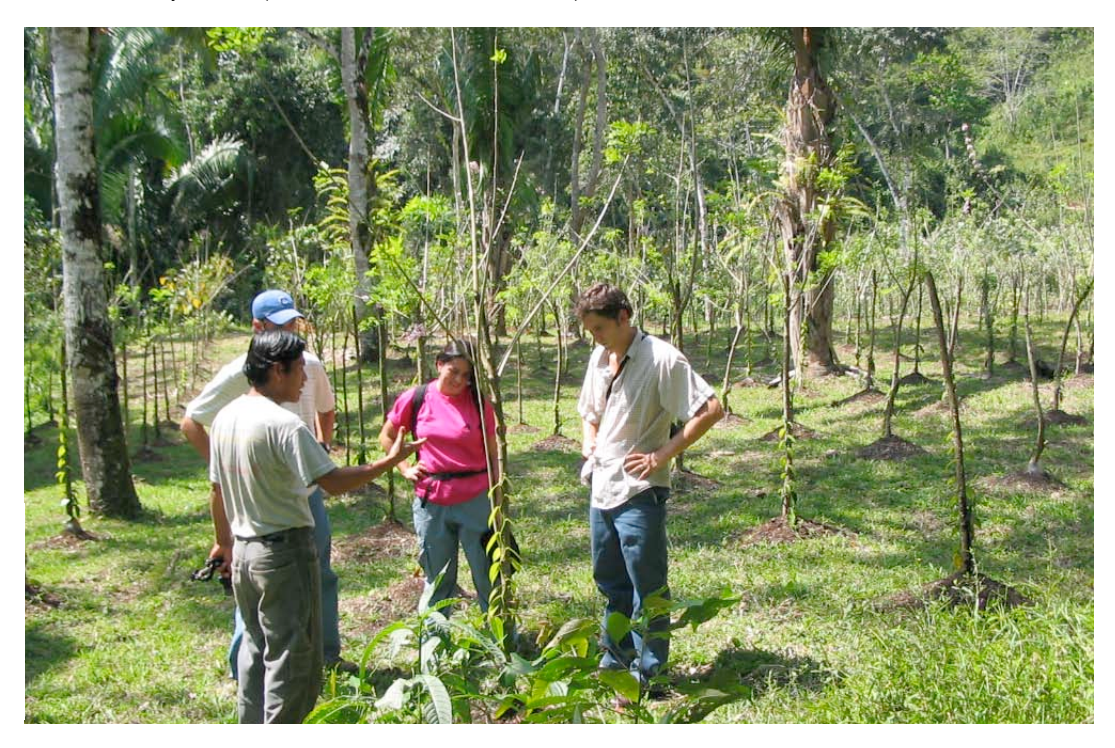
Presentation of a forest garden.

Forest gardening is based on a methodology called analog forestry, which imitates natural forests. It synthesizes scientific knowledge on conservation and biodiversity with sustainable agricultural techniques and local knowledge about home gardens, giving place to a variety of tree crops compatible with natural forest permanence. This constitutes an effort by the local farmers not only to preserve the present forest coverage but to restore the ecosystem and its biodiversity, while achieving permanent productive cropping systems dominated by trees (Del Cid and Garcia 2005).