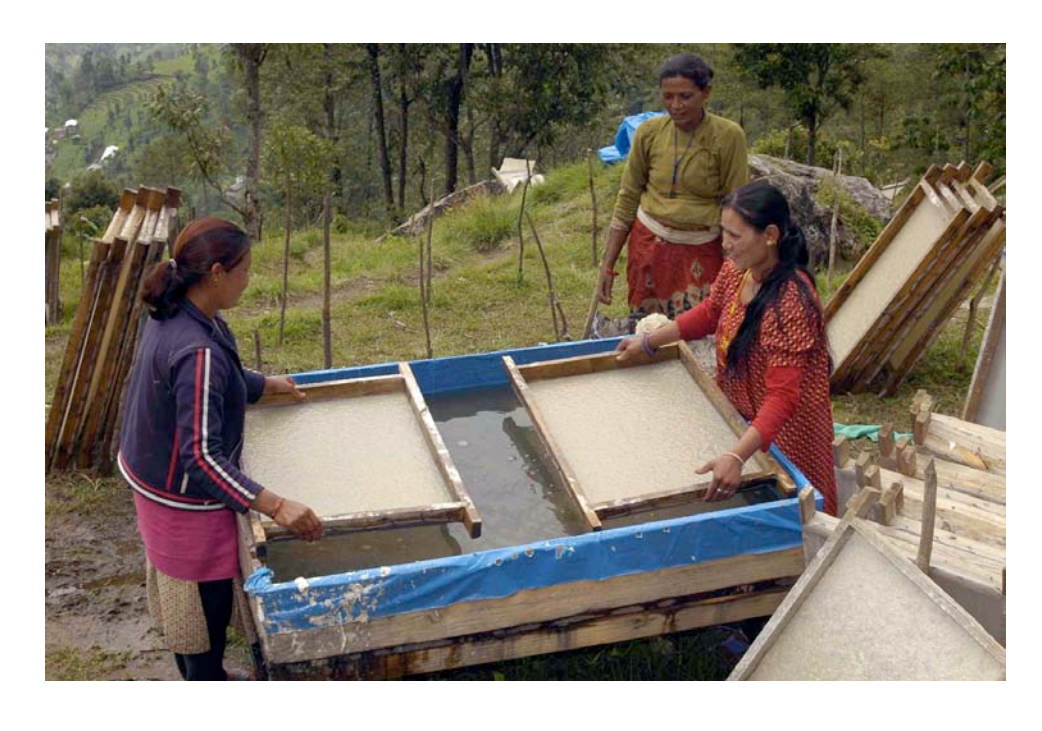
Women working in Lotka paper-making enterprise.