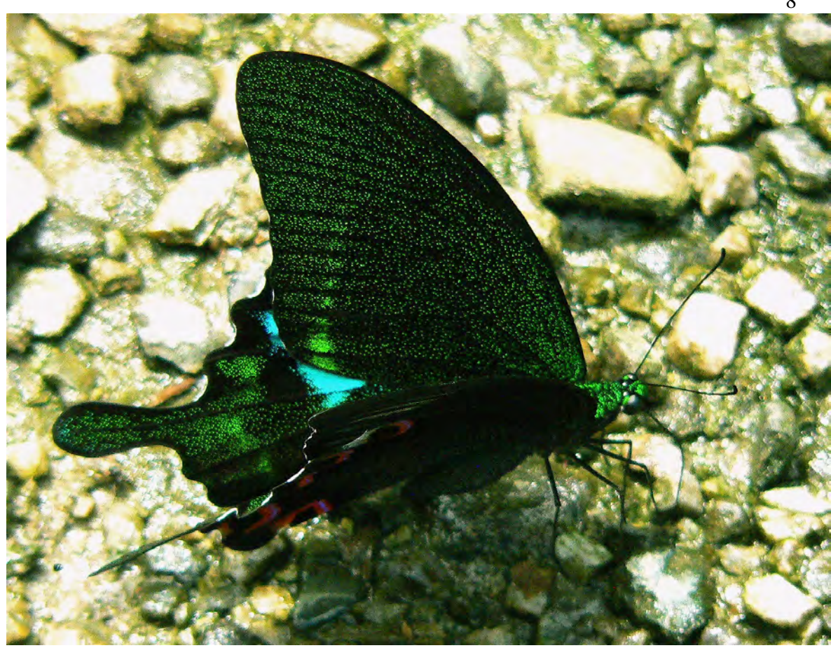
The aqua blue spot on the hind wing of a Paris Peacock, Papilio [Achillide] paris, flashes vividly in flight but is mostly hidden when the insect alights.

individual was not overly shy but as it was small and flew in quick, darting motions, we soon lost track of it. Another individual, seen at about 13:30 and some 30 km south of the first sighting, worked over a climber but soon disappeared without giving us a good view.