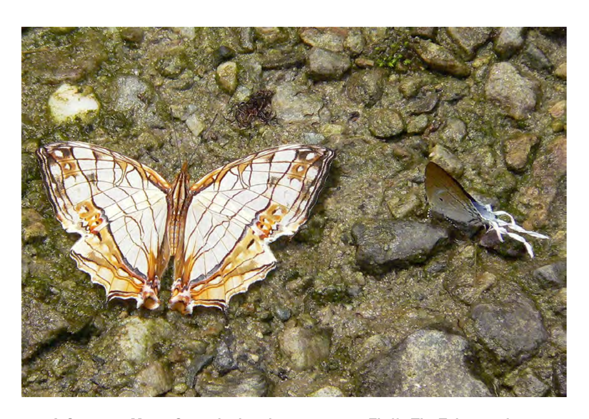
A Common Map, Cyrestis thyodamas, near a Fluffy Tit, Zeltus etolus.

To us, the most remarkable butterfly noticed on the trip was seen on the 19th. I first mistook the insect to be a black dragonfly as it settled on a bush near the road. Only when its small triangular wings flipped up as we drove by did I realize that this was a butterfly, later identified as a Green Dragontail, a species with long black tails and a transparent "window" in the stubby forewings. On first contact this