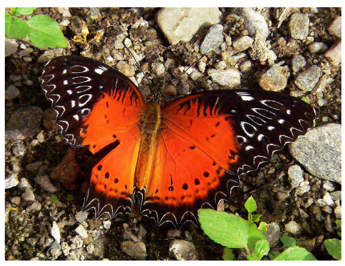
The conspicuous Red Lacewing, Cethosia bibles , did not appear to be common.