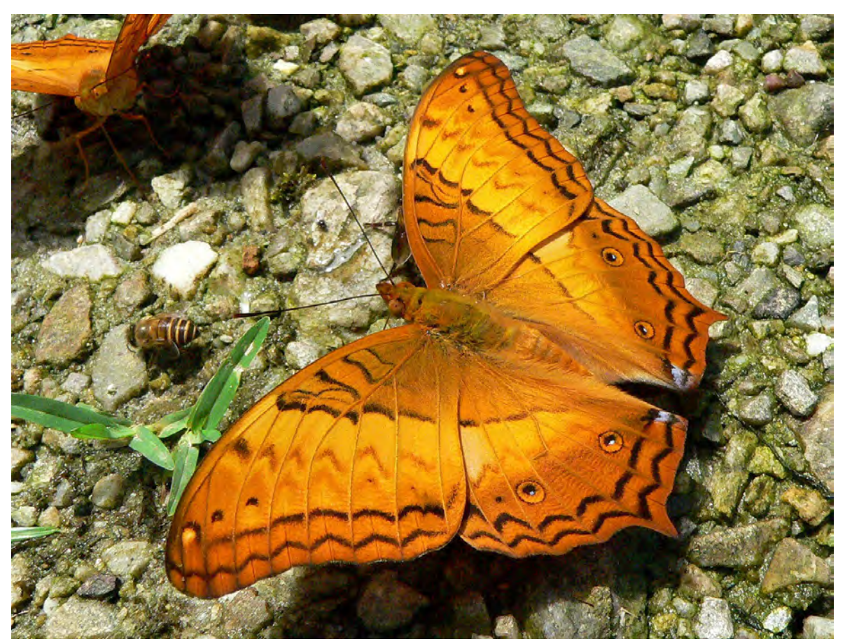
A Large Yeoman, Cirrochroa aoris . A small Apis bee with a ringed abdomen sits to the left of the butterfly.

The large Rock Bee Apis dorsata with an elongated, ringed abdomen was easy to spot. But there were others of two sizes, both smaller than the Rock Bee. The middle-sized bee possessed a comparatively wide abdomen, black-tipped and without rings, and was likely in the Apis mellifera , the Common Honey Bee, group. The abdomen of the smallest bee, likely the Indian Honey Bee, Apis cerana indica , displayed three or four pale rings. Dead bodies lying about indicated that visiting here had been going on for a while. In addition to the honeybees, an insect buzzed around flashing a stunningly iridescent, light-blue abdomen. Unfortunately, we succeeded neither in photographing the creature nor determining whether this was a bee or a fly. We did not record coordinates for this site but estimate the stream ford was at about 900ft elevation at about 28° 17' N and 56° 55' E.