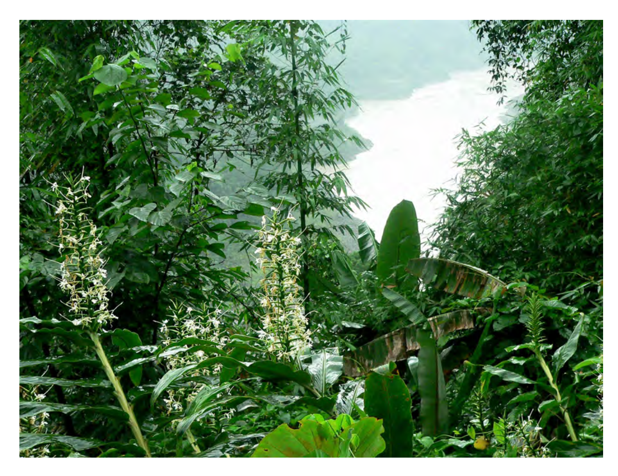
Wild gingers, bananas, and bamboos at c 400m/1020ft frame the lower Siang River not far from where it exits into the plains.

In July 2006 we had a splendid visit to the Siang Valley [also known as the Dihang Valley on some maps] in Arunachal Pradesh, northeast India, traveling on the 17th from Pasighat to Yingkiong and then over to Shimong village. On the 18th we attended meetings in Shimong, and then returned to Pasighat on the 19th. When journeying on the true right bank of the Siang, we were on the easternmost slopes of the Himalayas and in a tropical biome, the slopes lush with vegetation. Even where agriculture predominated, the primary color was green; only hamlets and very recent tracts of slash-and-burn agriculture showed brown