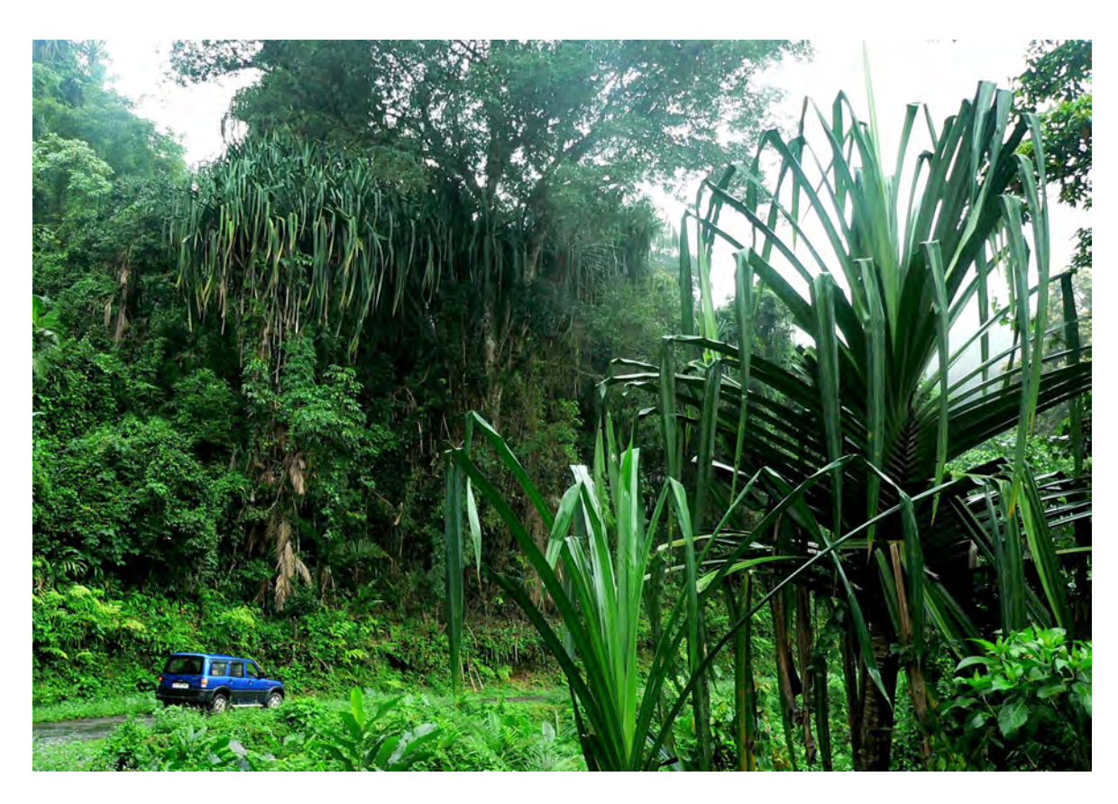
Roadside vegetation included numerous Screw Pines, Pandanus , seen here on the right and above the road as well as tree ferns and a climbing bamboo.

individuals often sitting with wings spread. In addition, big, black Red Helen swallowtails were also conspicuous, often several insects sitting close to each other on the damp soil, their wings continuously vibrating. Just beyond the Red Helens, a host of Chocolate Albatrosses clustered together, the pale yellow and light green of their under wings less noticeable than the flashy white of their upperparts. Individual Paris Peacock swallowtails danced by, a large, aqua-blue spot flashing from the top of each hind wing. In flight, this creature looks black, but if seen at close range the black is covered with sparkling, iridescent green dots. One of the most exciting species, the Five-barred Swordtail, was not eye-catchingly colorful. Instead, its wings exhibited a muted green wash with accents of pale salmon orange, all set amid a black framework. An unusual feature of this throng was that all individuals, except one tattered Yeoman and a slightly damaged Red Lacewing, were remarkably fresh. Even the delicate "tails" on a Fluffy Tit were intact.