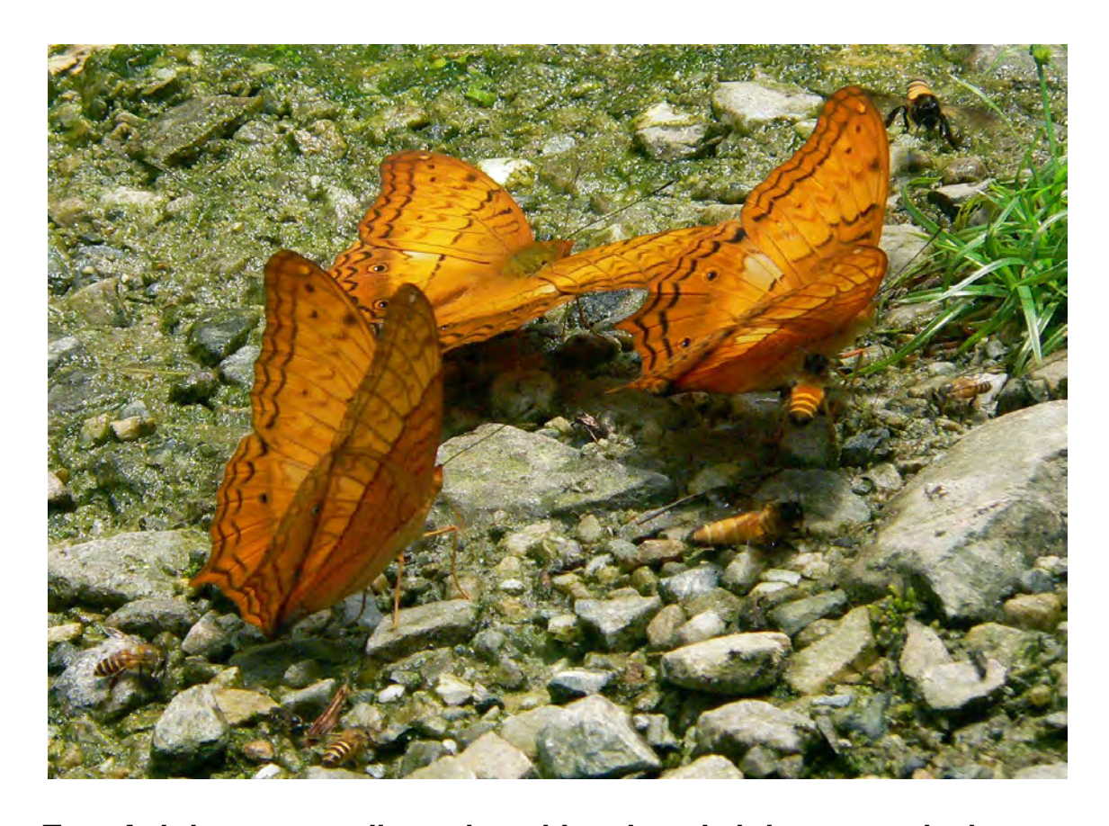
Two Apis bees: a small species with a ringed abdomen on the bottom left and Apis dorsata the bee with the long abdomen on the ground on the right near the Large Yeoman, Cirrochroa aoris .

Chocolate Albatross Appias lycida Common Grass Yellow Eurema hecabe