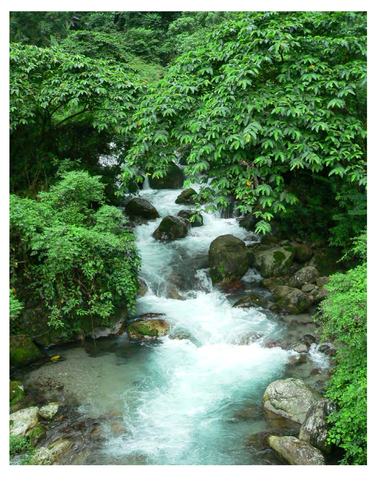
A side stream overhung, on both the top right and left, by a fig, Ficus , a common genus in this biome.

"mouth" [the steep terrain immediately north of Pasighat], the majority of the slopes at tropical and lower subtropical levels show vegetation modified from the original state. Indeed, while the entire landscape may be green, much of this cover is many generations removed from the original forest.