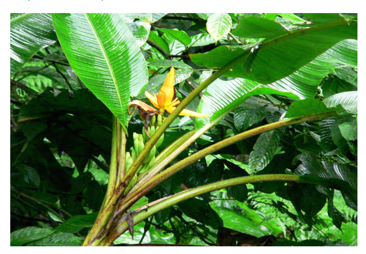
A wild banana with a nearly erect flower and fruit stalk, 400m/1300ft., 19 July 2006

rainy season flowers in bloom and we were not disappointed for, among others, handsome wild gingers with pale, creamy yellow flowers on terminal inflorescences grew in some profusion while, a narrow-flowered, yellow Impatiens brightened the edges of rivulets. In addition, a small (2.5m-tall) wild banana with its yellow flowers projecting upward from the end of an erect stem grew in other gullies. Bananas, in my previous experience, exhibited hanging flower stalks so this species was a surprise.