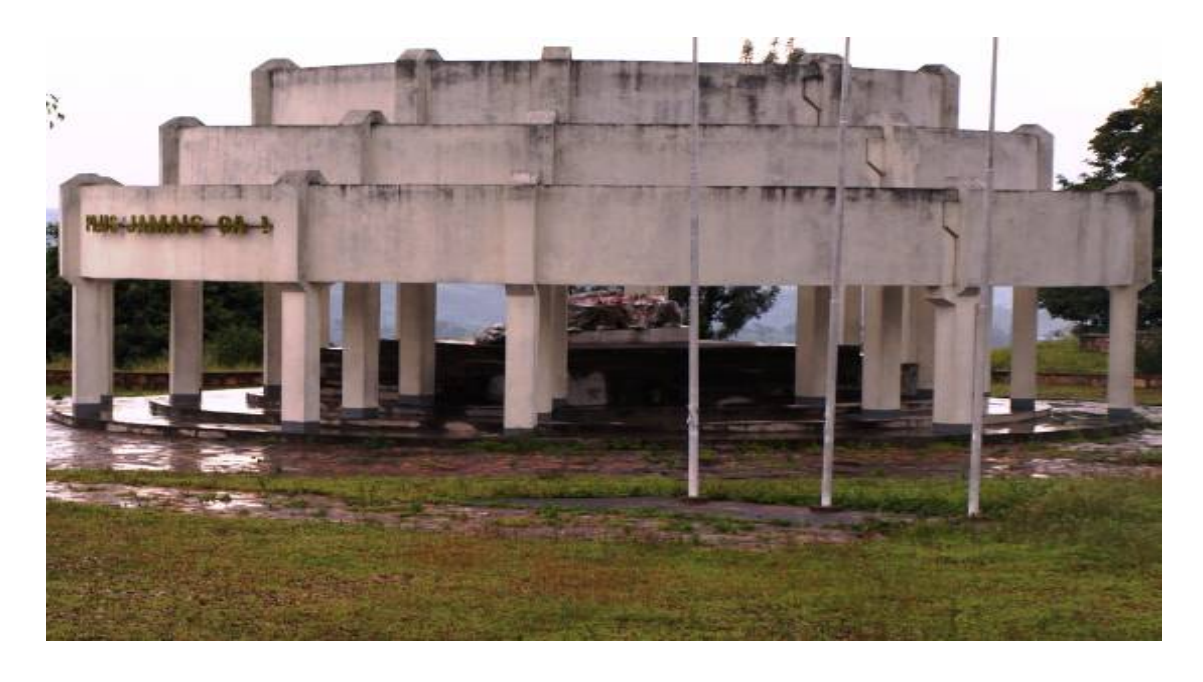
The "NEVER AGAIN" Memorial site for Kibimba which Lycee students burned during the 1993 interethnic violence.

One of the most important ways in which the Kibimba Peace Committee helped to expand the peace committee model throughout Burundi was when several of its members formed MI-PAREC in 1998. MI-PAREC has worked closely with Kibimba ever since, but has dedicated its efforts to taking the peace committee model and the Kibimba experience around the county.