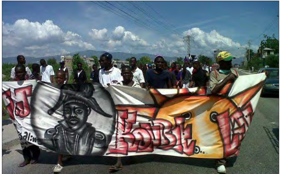
Konbit Soley Leve, a youth-led social change movement in Haiti, marches in honor of Dessalines Day to celebrate the founding father of Haiti.