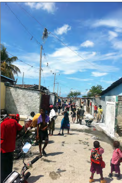
Cite Soleil uses their own community resources to promote local livelihoods.