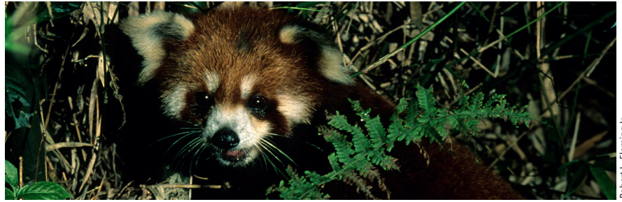
The Red Panda is among the many rare species protected through community conservation efforts in the subtropical forests of Arunachal Pradesh.

www.future.org Blog: fgarunachal.blogspot.com