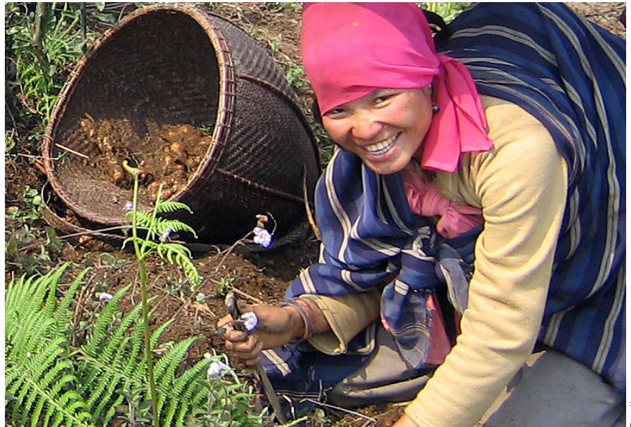
More than 90 women's groups are improving nutrition and increasing family income through kitchen gardens and micro-credit programs.

Women's groups mobilize communities, improve health and sanitation, and create sustainable local economies. They inspire groups, such as farmers and youth clubs, to join the process.