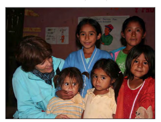
"One thing that makes this program unique is the mix of international students that come together to share each other's stories, which are different but yet similar. We can help each other in very unique ways that I don't think I could do in any other program."