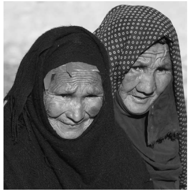
Community Health Workers in Bamyan Province participated in women's only workshops, learned basic skills through a review of their own pregnancy histories, and organized women's action groups for health.

Careful data analysis, including rechecking of the data three times, showed that child mortality had declined, and, the declines had held during the two-year absence of formal outside assistance, demonstrating a method that allows women themselves to achieve the impact.