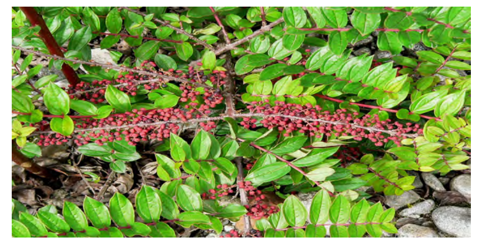
Coriaria nipalensis growing among pebbles on the valley floor

weaving past boulders, dropped steeply to a gravely stretch, and then on to sandy flats only some 3m/10 feet above the flowing water. In May 2006, this valley-floor was not much re-colonized by plants, likely due to recurring high water flooding. However, a few small alders and a Coriaria nipalensis , in red fruit, had taken root. The Coriaria surprised me. The plant is most often noticed along roadsides in highly disturbed conditions but the idea that it might be a colonizing species, in the manner of an alder, had not occurred to me