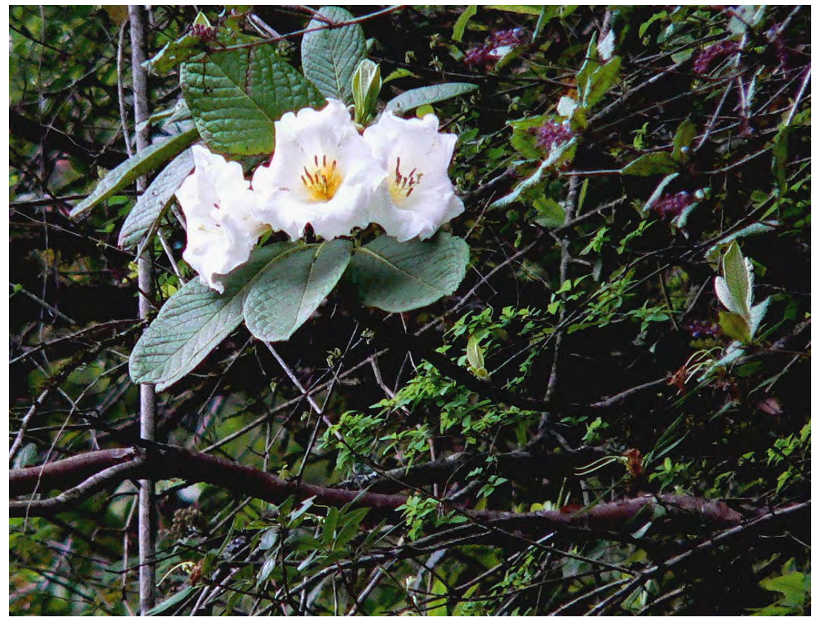
A rhododendron, likely R. nuttallii, at c.1980m/6500ft.

A flood of the 2000 magnitude is a result, partly, of heavy precipitation in an a mountain region with steep, fragile slopes. The initial massive slide that dammed the Yigung, for example, was a natural occurrence, the slip originating high on a densely forested hillside that saw little or no human activity. Interestingly, an even more severe flood occurred in this same area in 1901 and the high water mark was measured, in 1913, as 42.7m/140ft above normal [see F. Bailey, page 109]. Over the years, lakes have formed in glacial systems or by landslide impoundment and when their dams burst, valleys below are scoured; almost all major, high-altitude Himalayan valleys show scars. In this day of improved satellite imagery, better understanding of the dangers involved, and with improved communication throughout the Himalayan region, damage caused by these floods can be partly mitigated and loss of human life reduced.