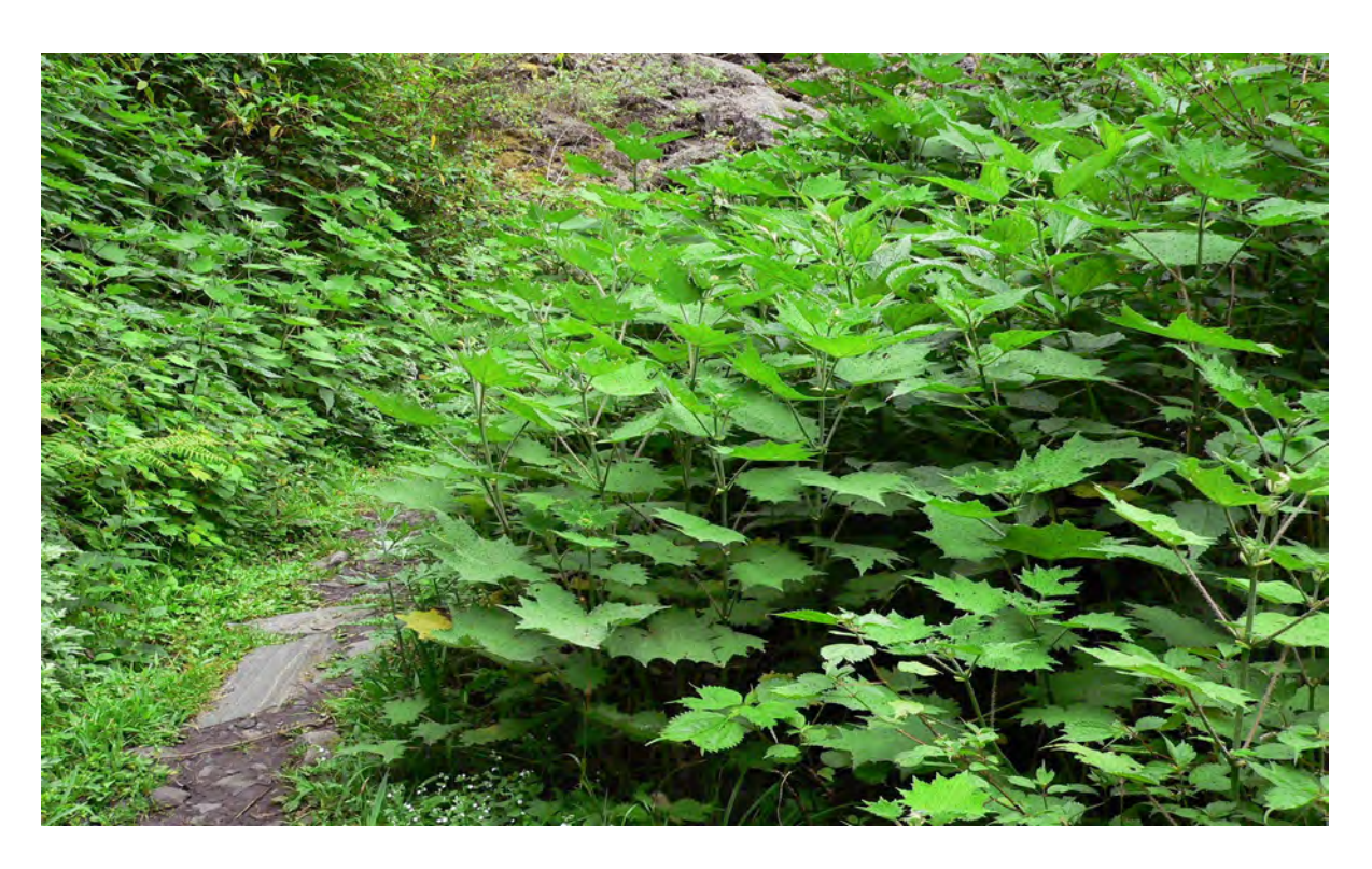
The local footpath on the left with a profusion of nettles on the right.

rises between gullies, was the Himalayan Alder (Alnus nipalensis).