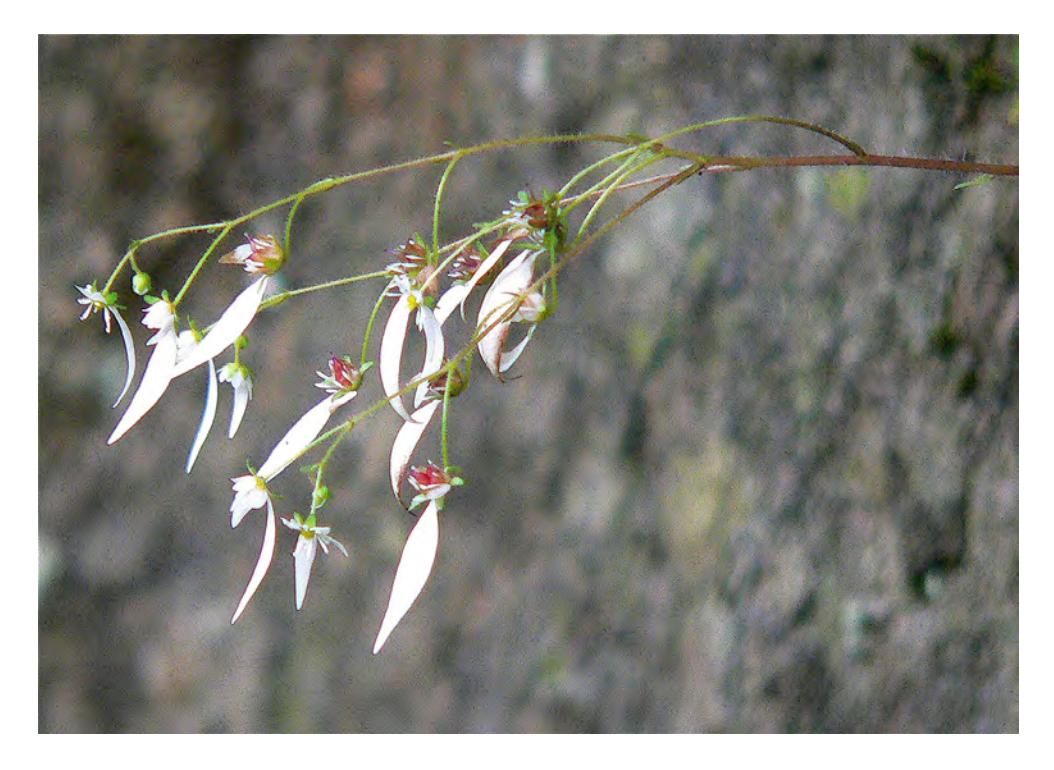
A Saxifraga-like flower growing from the cliff face.

Just beyond the bridge across the Rong, the footpath skirted below an exposed cliff and on this face we noted a small, white-flowered plant clinging to the rocks. Judging from habitat, the floral arrangement, and that the stems and scalloped, rounded leaves were lightly covered in short hairs, this species appeared to be an unusual Saxifraga . The remarkable feature of this particular flower was that one [rarely two] of the five white petals extended much beyond the others [see illustration]. Above these white blooms, sterile fronds of the Soft Dryad ( Drynaria ) clung to the cliff and other ferns including Asplenium and Polypodium also flourished. In addition, a rhododendron, likely R. nuttallii , with much "wrinkled" leaves and large flowers, the white petals changing to yellow or orange towards the throats, hung over the top edge of the cliff. Rhododendrons are relatively uncommon at c.1980m/6500ft elevations and while this is rather conspicuous species, we missed recording it in 1996 as it had likely finished blooming by our June visit.