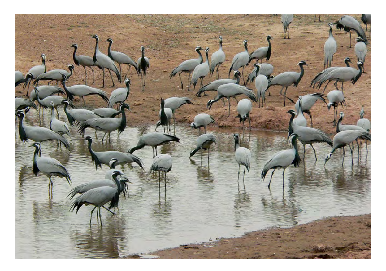
Birds in the early afternoon resting near a "tank" at the edge of Keechan.

town of Phalodi. However, the idea of a communal feeder of this magnitude, could, with suitable publicity, be an important fundraiser. Communities need to develop local sources of revenue and in Keechan this could be the judicious use of the cranes. If fees were levied to witness this amazing phenomenon and the funds channeled into projects that benefit the whole community, religious merit would accumulate not only for feeding the cranes but also for doing something that benefits the human residents of the area. And, as a side benefit, the criticism of feeding so much grain to birds would be blunted.