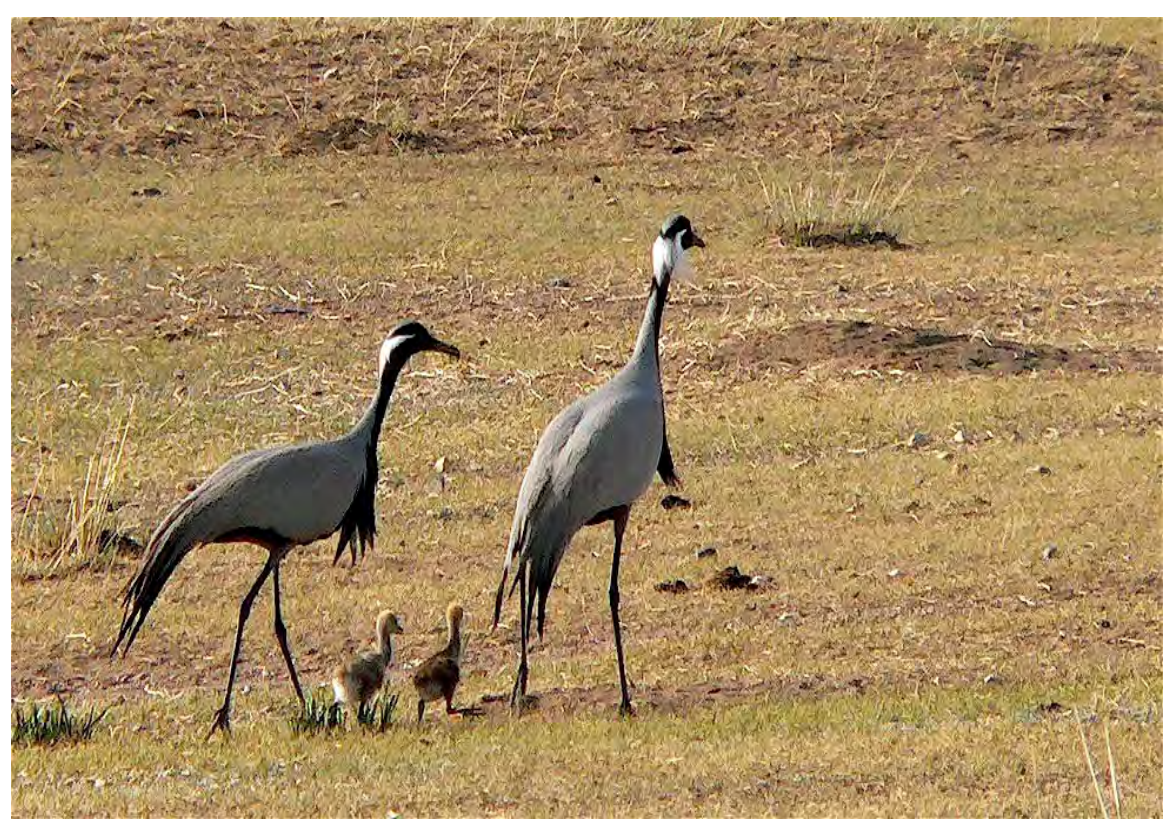
A Demoiselle family near the Moron airport in central north Mongolia, 20 June 2005.

Two adult Demoiselle Cranes, sleek gray birds with puffs of long, white feathers extending backwards from the sides of their black heads and loose, black feathers spilling over the upper breast, coaxed two surprisingly short-legged youngsters across the grassy plain. The brown-bodied hatchlings, with pale orange-tinged heads atop long necks, were easily able to keep up with their parents as the family moved past clumps of green iris leaves and mounds of grass-studded brown earth within sight of the nearby Mörön airport in north central Mongolia.